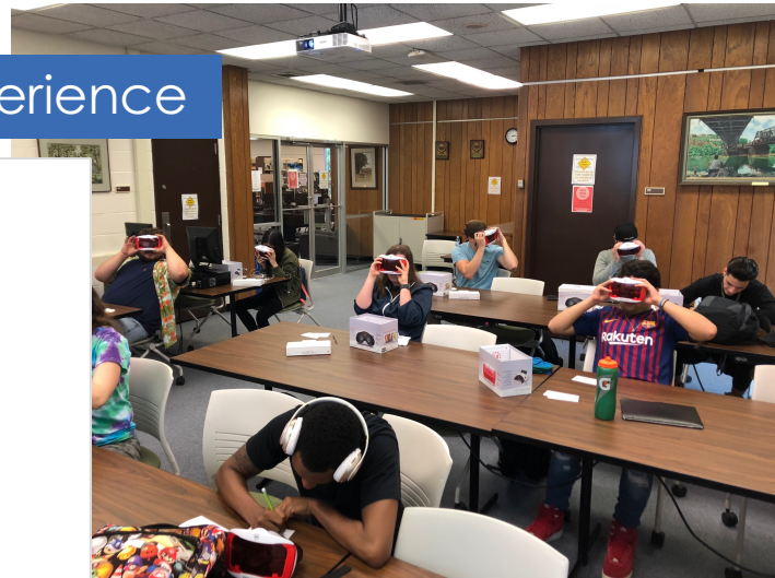
Students in AFAM 409 using View Masters

Students were asked to score the degree to which they agree with the question “How much did 360° video help you understand materials in your class?” on a scale from 1-5. We also received qualitative feedback from 13 students (40%).